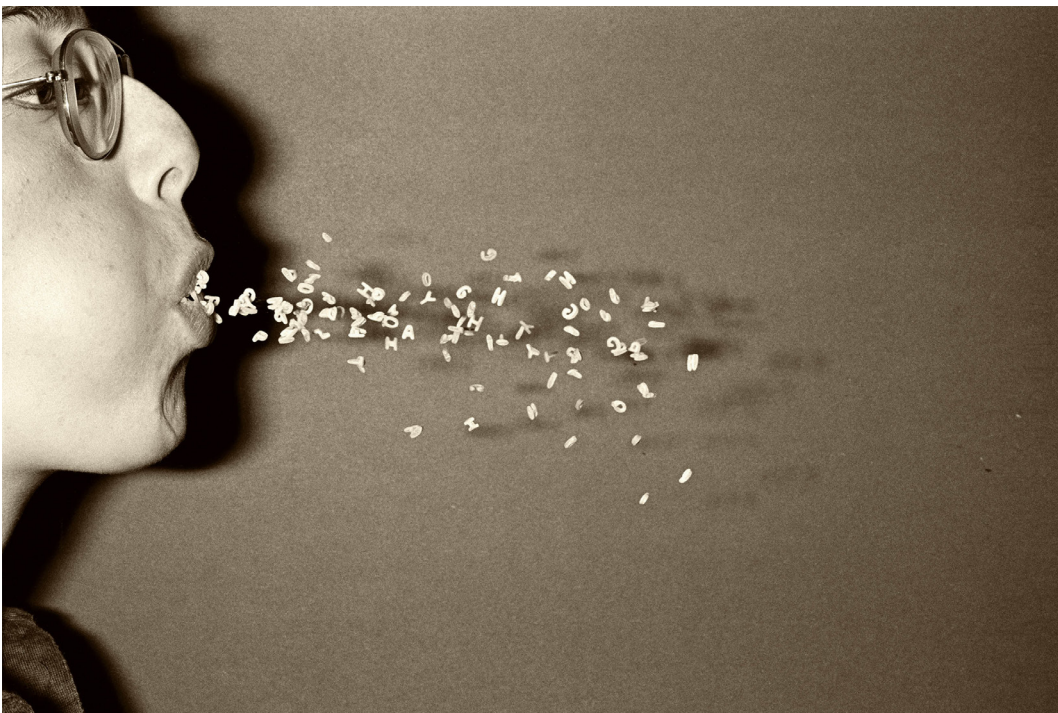
Front Image: Les Krims "Spitting Out the Word P-h-o-t-o-g-r-a-p-h-y, 1970" Inkjet Print, 13" x 19", Printed by Les Krims, in Buffalo, New York

Media Contact: Tom Jimmerson 310.815.1100 or tom@cardwelljimmerson.com www.cardwelljimmerson.com